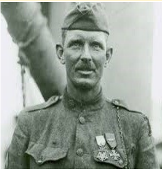
Alvin Cullum York Medal of Honor

In honor of World War I and the four WWI Medal of Honor recipients native born in Tennessee, the TMCA will be giving out a single “Best of Show” display award during each of the next four TMCA Shows.