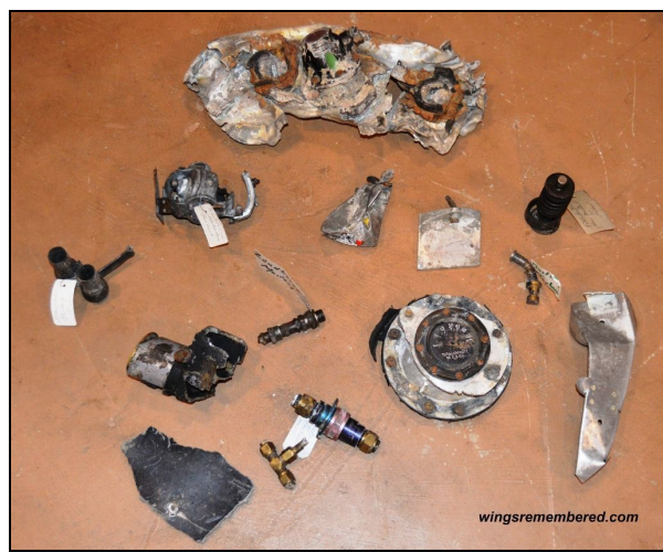
Miscellaneous Relics from Crash Site of F6C Mustang 42-103460