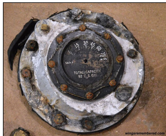
Wing Fuel Tank Gauge from Crash Site

Charles Runion Wings Remembered, Inc. 501 (c) (3) non profit Lebanon, TN USA Museum Web Site: http://wingsremembered.com/