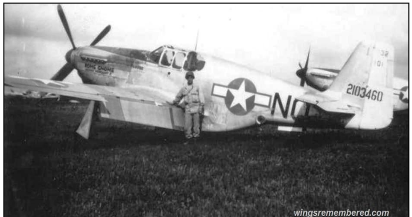
F6C Mustang No. 42-103460 Shot Down Dec 25, 1944. "The F6C was a reconnaissance version of the P-51C Mustang."