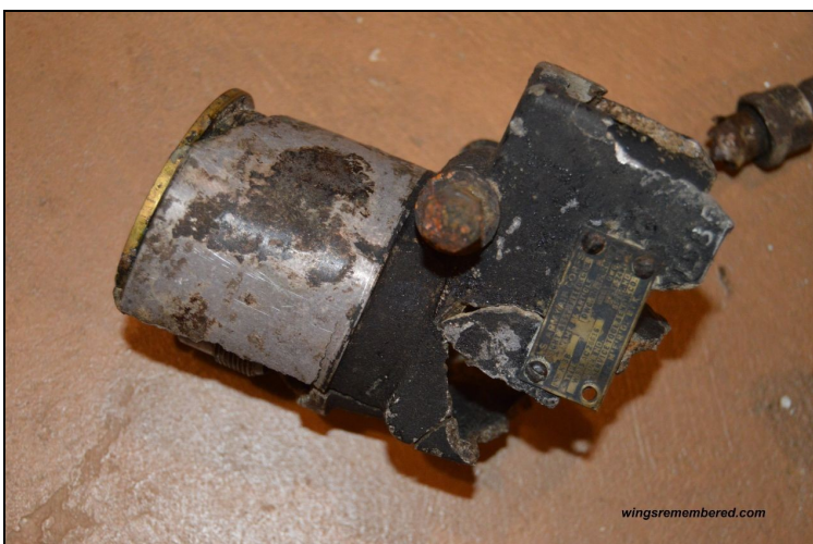
Gun Sight from 42-103460