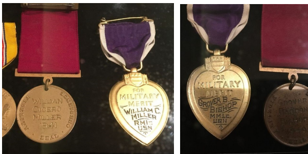
Five Pearl Harbor Killed in Action Navy Purple Hearts at one show. Very rare !