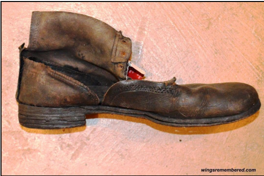
Pilots long lost shoe found decades later at the crash site.