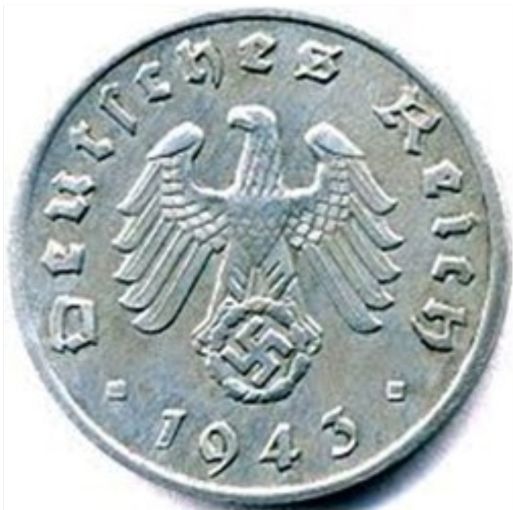
Obverse design of WW2 German Coins

In my own collection I only have three different Allied Occupation coins. When I visit coin shows I keep searching through German coins hoping to find more of these historic reminders of WW II.