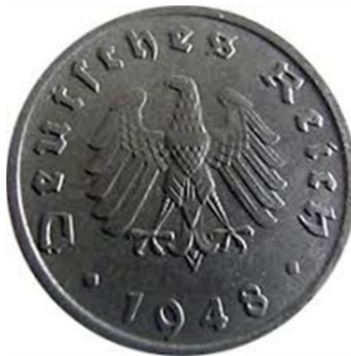
Obverse Design of Allied Occupation German Coins