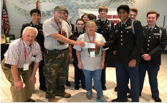
PAGE HIGH SCHOOL JROTC CADETS RECEIVING AWARD FOR JUDGING THE D-DAY DISPLAYS