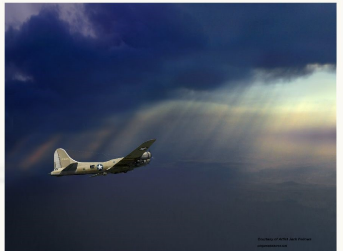
Roddenberry's War - Los Locos penetrating a tropical front in the Solomons. Illustration for Steve Birdsal 394th Bomb Sq. story