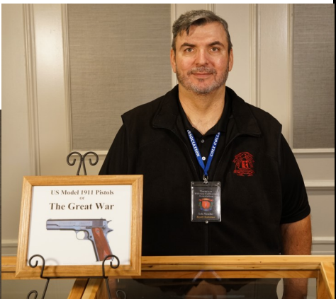
US Model 911 Pistols "The Great War"

IN HONOR OF THE 100TH ANNIVERSARY OF THE FIRST WORLD WAR A CASH PRIZE OF $100 WILL BE AWARDED FOR BEST-OF-SHOW DISPLAY AT THE 2017 FALL/WINTER SHOW