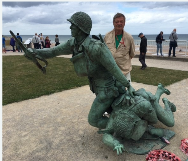
broke through German defenses on D-Day, June 6, 1944. The monument and the original bunker which it sits atop are to preserve the legacy and pay honor to all National Guardsmen who have fought in the European theater.

The Tennessee Military Collectors Association is an organization who's members not only enjoy their hobby of collecting, but also enjoy visiting and studying the locations where historical events took place. If in the future you make such a pilgrimage, please send a photo and description to the club secretary. So, all may enjoy your experience!